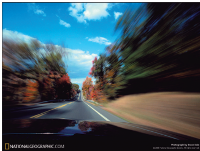
FIGURE 401.2. Speed induced smear is illustrated by a photograph by Bruce Dale taken from a speeding car. As this image illustrates the effect of the speed is larger where the optical flow is faster, in the far periphery. In the frontal field where a bi-optic telescope is likely to be aimed there is minimal effect of the speed on the resolution available in the image.

A histogram of the VF requirements for different states (see fig. 4 in Peli) 7 shows that the binocular requirements are distributed ~110°, with an additional six states requiring 70°,